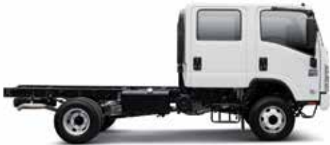
NPS 300 Crew